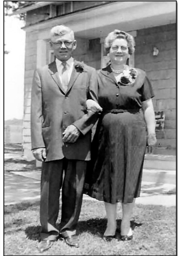
Above: taken in front of the Farm House the day of the 25 th Wedding Anniversary Celebration.