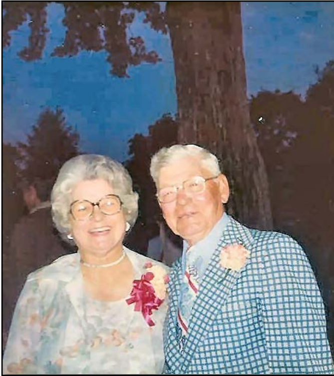
Above: Picture taken outside of All Saints Church just after their 40 th Anniversary Mass.